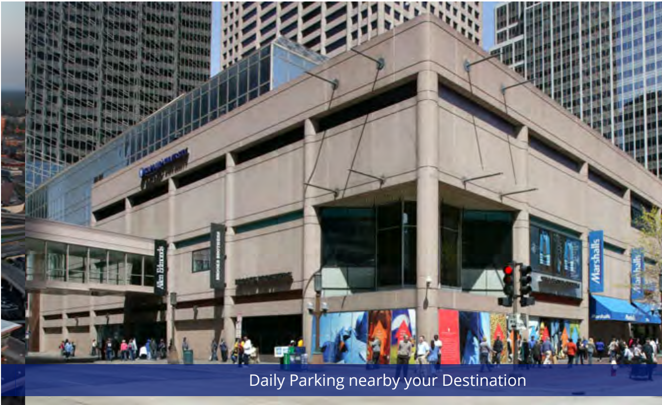
Daily Parking nearby your Destination